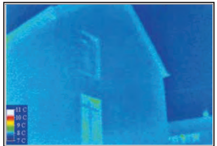
This thermal image shows almost no heat loss from SIPs built house.

Highly energy efficient buildings achieving whole wall and roof U-values of 0.19 – 0.10 W/m 2 .K or better. Kingspan SIPs panel offers up to 70% reduction in heating bills